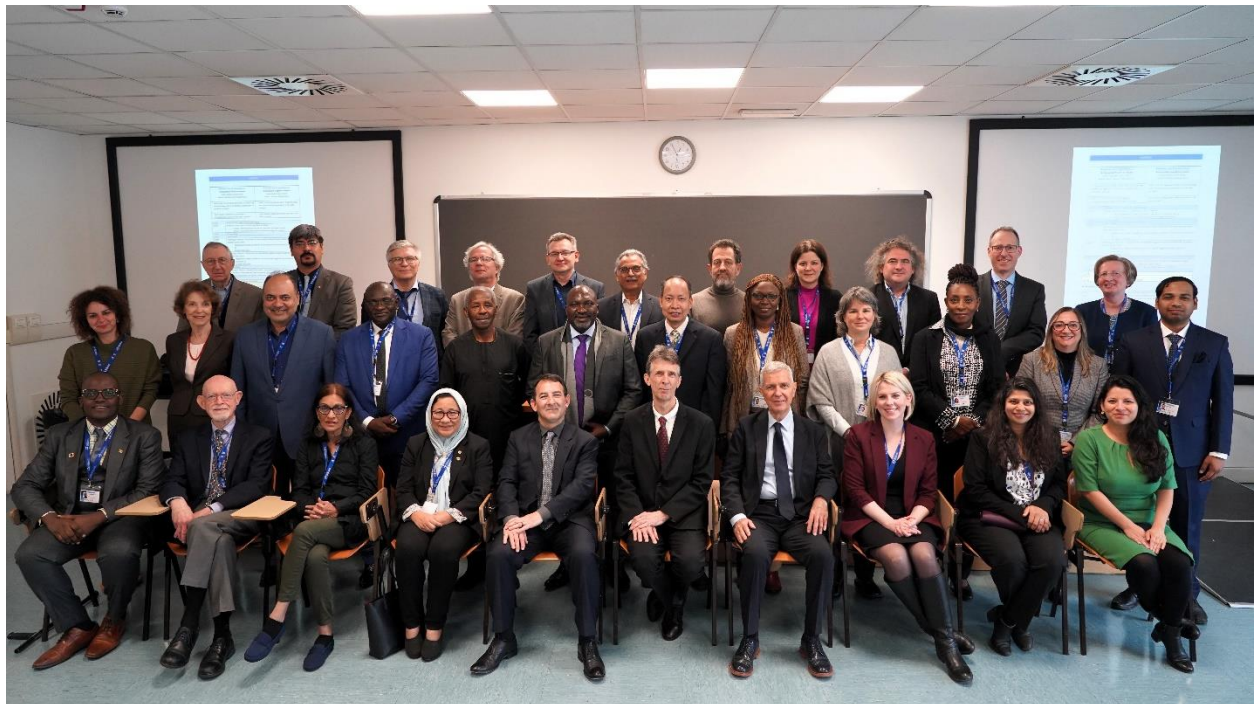
Figure 1: Group photo during the BWC proof-of-concept exercise in Trieste, Italy on 27-28 February 2024.