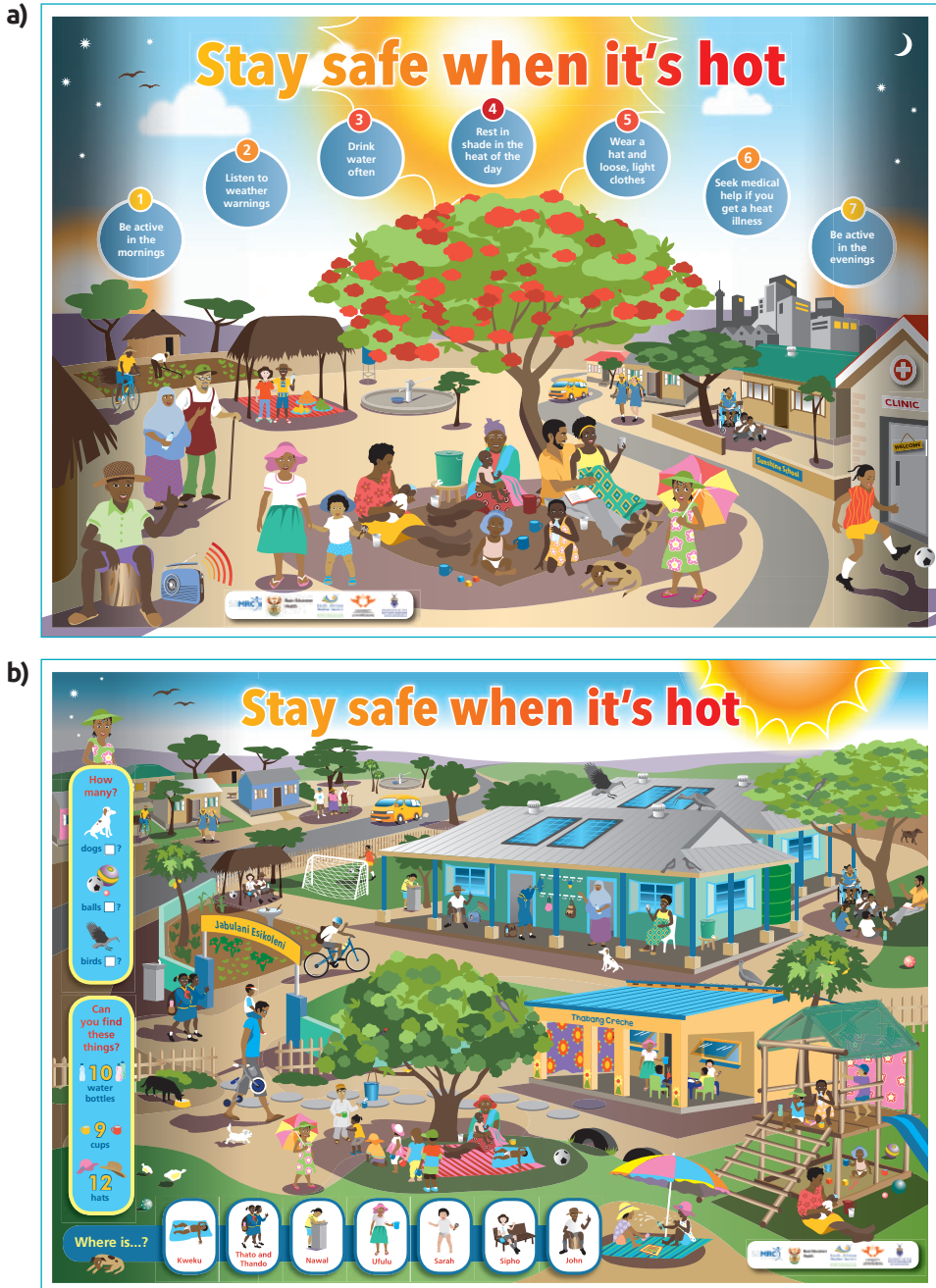
Figure 2 a-b: Two posters for primary school children designed to a) illustrate the best ways to protect yourself from extreme heat and b) have fun and play a game while learning about safe behaviours during hot weather