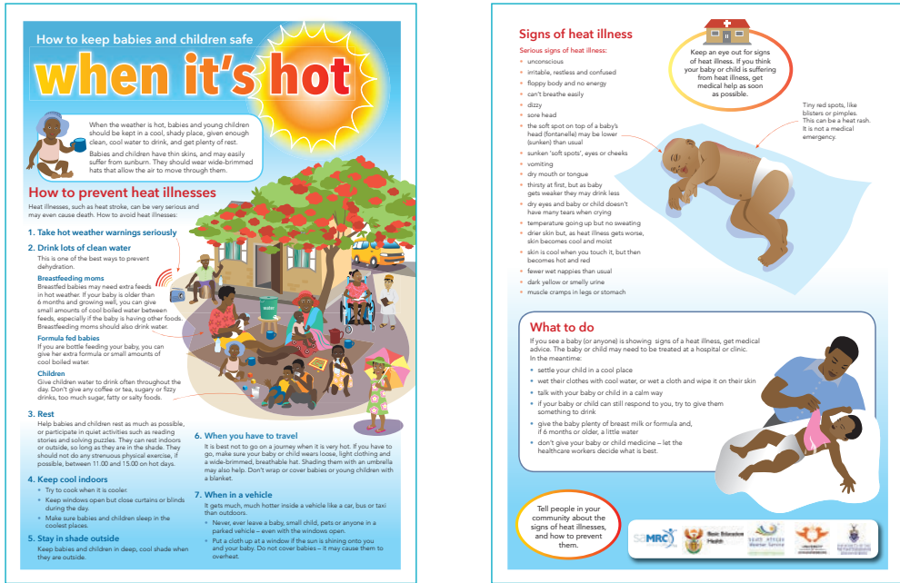
Figure 3: Flyer illustrating what to do to keep infants and children safe during periods of extreme heat

These products were co-developed with leading health and education stakeholders which led to their approval and uptake by a wide audience. For example, in February 2023, during a period of extreme heat, around 1,000 flyers and posters were dis-