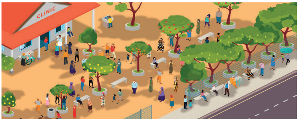
Figure 4: Results of a visioning exercise to promote potential heat-health actions for primary healthcare facilities

These products were co-developed with leading health and education stakeholders which led to their approval and uptake by a wide audience. For example, in February 2023, during a period of extreme heat, around 1,000 flyers and posters were dis-