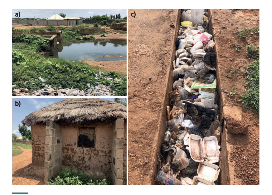
Figure 2: a) A city-level storm drain that stops abruptly in a poor community. b) Piers of concrete blocks added to a mud house to increase its resilience to flooding. c) A roadside storm drain blocked with solid waste rendering it ineffective.

example, average daily precipitation is not able to capture rainfall intensity, which is the most important parameter for the flash floods in Tamale.