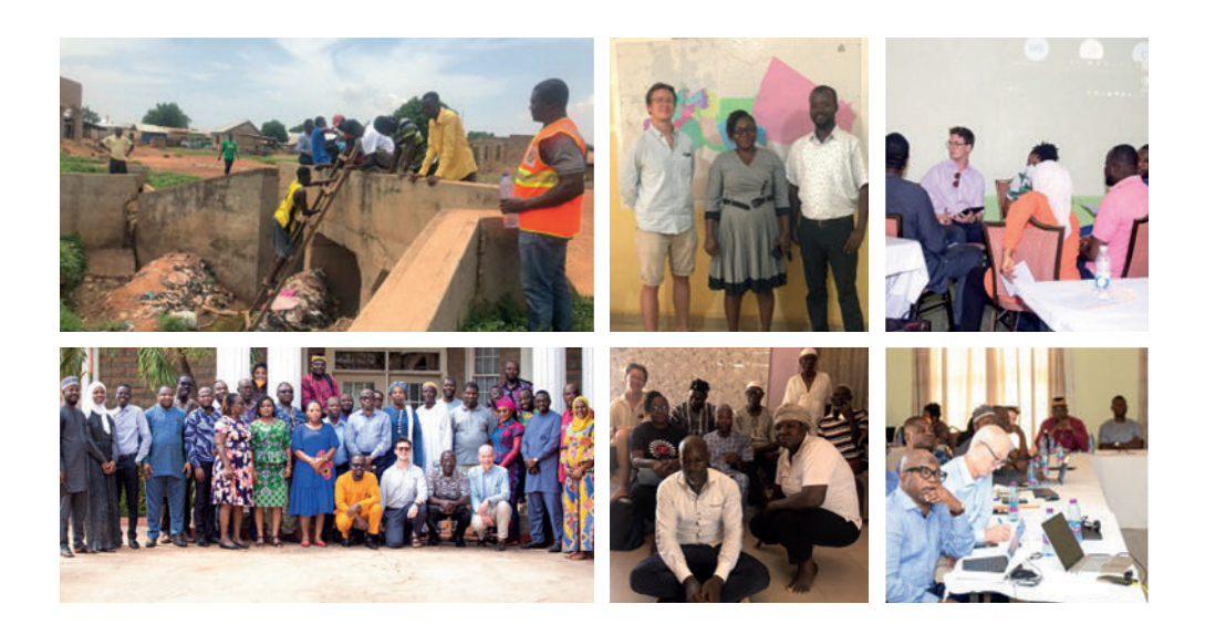
Figure 1: Images representing some of the stages of the co-production methodology. Top left shows the installation of the ultrasound sensor over a storm drain. Bottom left shows some of the participants of the initial workshops. Right shows interviews, breakout groups and focus groups.

community leaders and facilitated by local researchers, who relied on extensive note taking to capture data. A thematic analysis of this data was subsequently conducted.